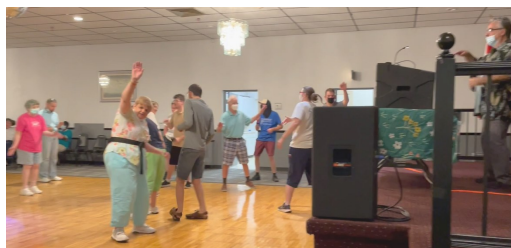
The dance floor was hopping at our Summer Dance!