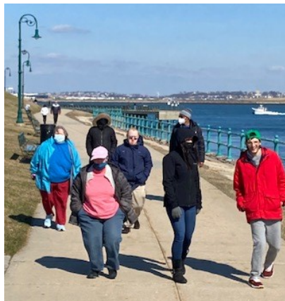
CBDS participants enjoy a visit to Castle Island in South Boston.