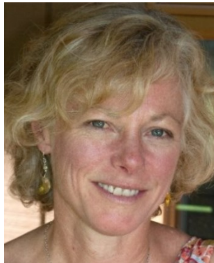
CC King Art Instructor