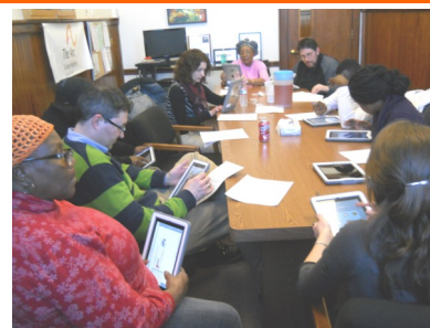
GWArc staff members participate in iPad Training at Chestnut Street.