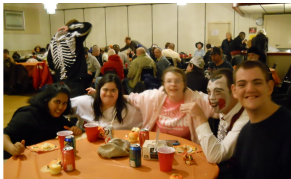
GWArc participants enjoy each other's company at GWArc's Halloween Dance.