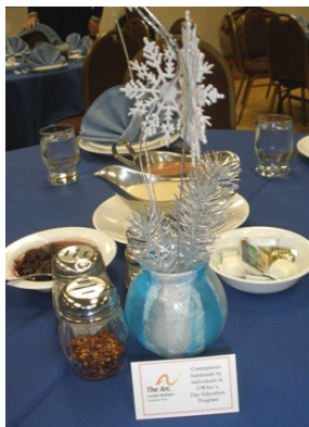
Beautiful centerpieces for the Rags LaCava celebration event were hand-made by Day Education participants.