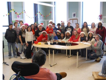
McDevitt Middle School students visit Day Education participants at Chestnut Street. Students sang holiday songs and brought gifts for participants at both sites.