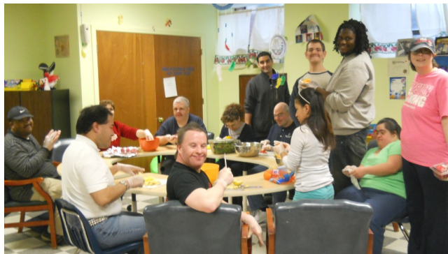
The GSE Semester Break crew works together to make a spaghetti and meatballs lunch.