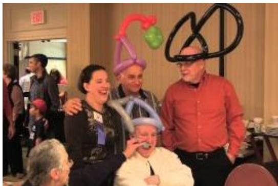
The Allain Family and friends enjoy Harvest Breakfast.