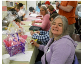
Attendees of the Recreation "Meet & Greet" event held in January enjoyed pizza, Bingo and great prizes.

Trips to sports and theatre events are planned, including college hockey and basketball, Harlem Globetrotters, Disney on Ice, Reagle Music Theatre and more!