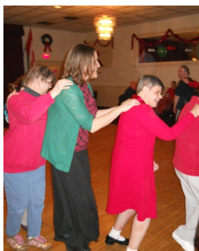
Participants and staff members dance the night away at GWArc's Holiday Party.