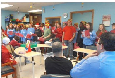
Students from the McDevitt Middle School in Waltham visited GWArc in December to spread holiday cheer.