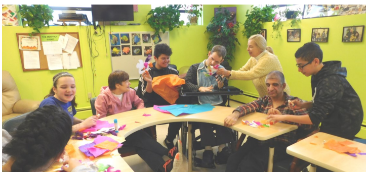
McDevitt Middle School students decorate paper masks with participants in our Day Habilitation program.