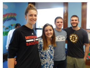
Bentley Service-Learning student volunteers bid farewell until the Fall