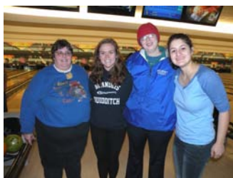
Brandeis Buddies went bowling off-campus in December.