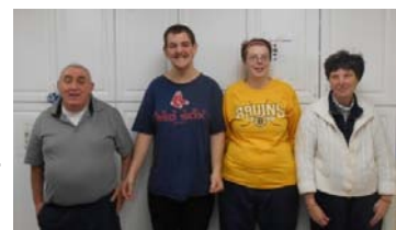
Watch City Self Advocates 2015 Officers