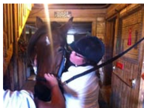
A participant in GWArc's Recreation Program prepares to go horseback riding.

Fall and Winter Recreation activities were a great success! Activities included the always popular Line Dancing, along with Brandeis Buddies, Bowling League, Healthy Cooking Club, Drama Club and Hip Hop Dance. In the Fall, we tried Horseback Riding for the first time, and it was a hit!