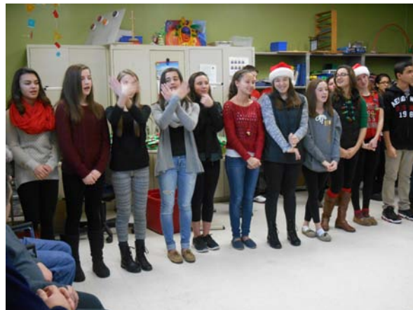
Students include sign language as they sing "The Twelve Days of Christmas".