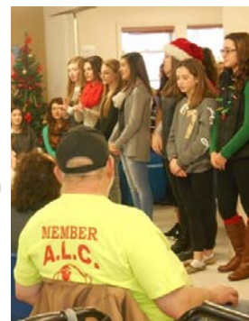
Participants at Woodland Road enjoy the students' festive holiday concert.