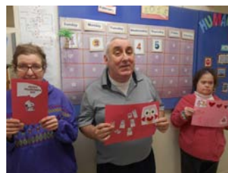
Members of Watch City Self Advocates display Valentine cards they made for Operation American Soldier.