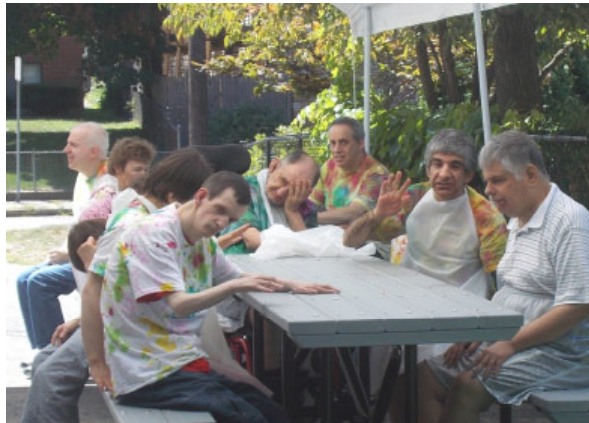
Day Education consumers wear tie-dyed t-shirts and enjoy each other's company while awaiting a barbecue lunch under the shady canopy at Chestnut Street.