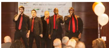
At left, Ball in the House entertains the appreciative audience at the Gala.