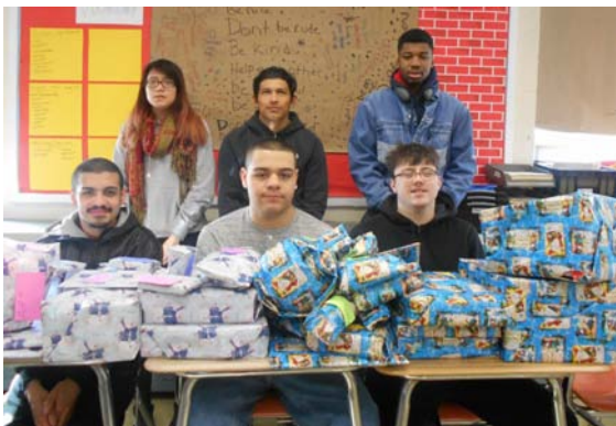
School to Work Transitions students pose with "Student Santa" gifts they purchased in December. Students raised funds and shopped at Walmart for holiday presents for a 5 year old girl and a 6 year old boy. Students wrapped all the gifts.