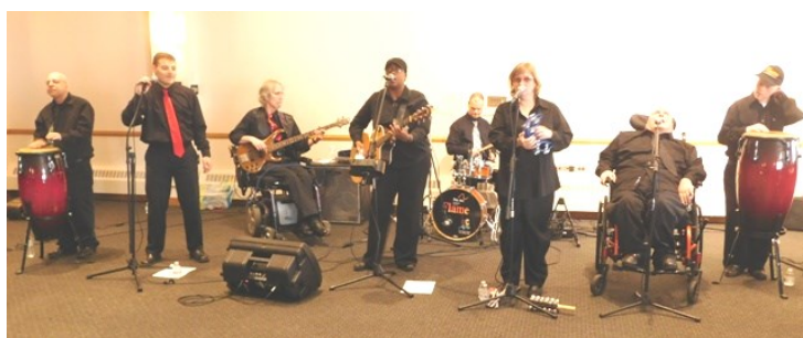
Flame the Band , whose members each have a disability, entertain at our Community Dance Party on December 10. The dance floor was full all afternoon!