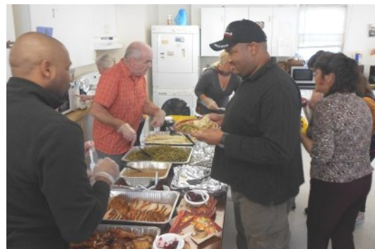
ECB participants and staff enjoy a delicious pre-Thanksgiving feast at Woodland Road in November. Participants prepared many of the dishes.