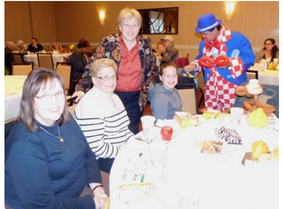
Waltham Mayor Jeannette McCarthy (standing) visits with friends and DC the Clown at Harvest Breakfast.