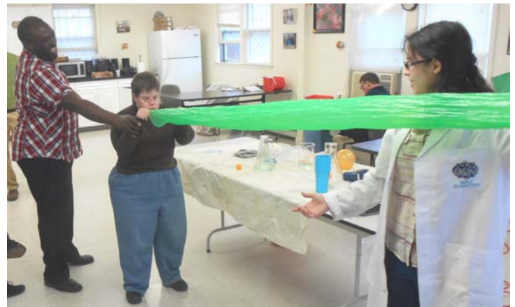
"Mad Science" visits Woodland Road in December with a number of interactive science demonstrations for CBDS and GSE participants.