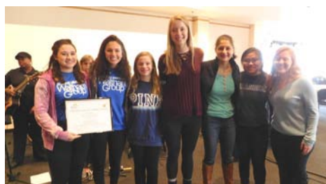
Brandeis student volunteers receive a Certificate of Appreciation for their assistance at the Community Dance Party.