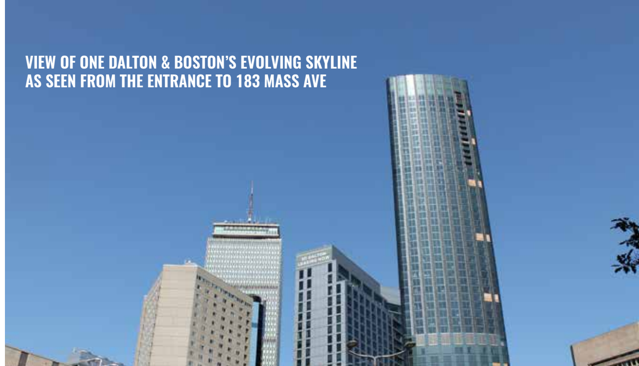
VIEW OF ONE DALTON & BOSTON'S EVOLVING SKYLINE AS SEEN FROM THE ENTRANCE TO 183 MASS AVE

Median household income (1 mile): $80,350