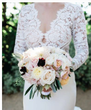
Clockwise from top: A rustic-chic table setting; the couple posed among the grapevines; the bride held a stunning bouquet; Park Avenue Catering used seasonal, fresh ingredients.