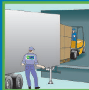
With OnLoad™ With OnLoad™ deployed, rear end of trailer flush with dock allow forklift on and off freely