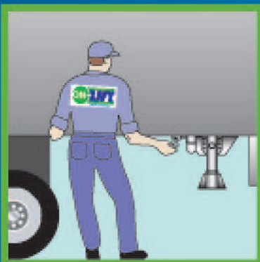
With OnLift™ Less time and effort to deploy (approx. 10 seconds)